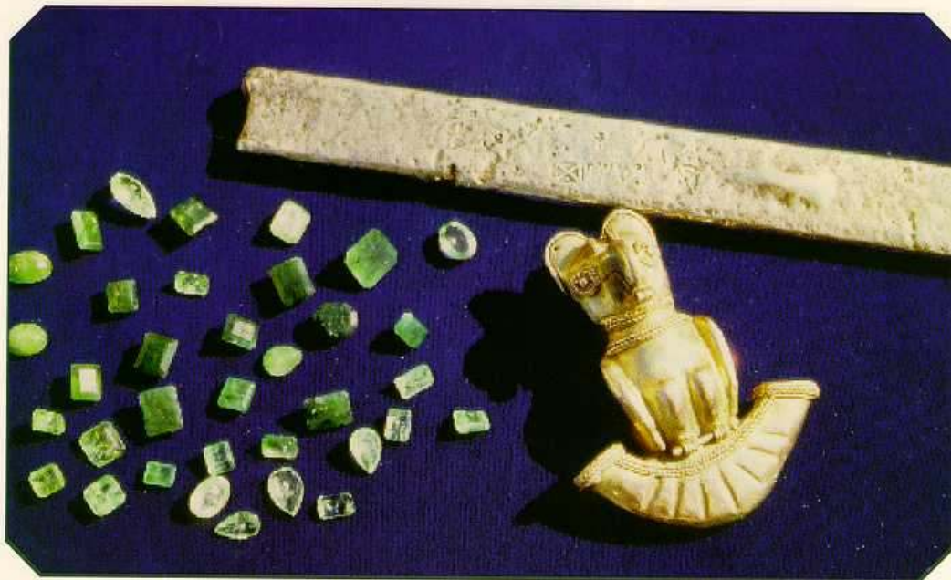
Emeralds, a silver bar and a very rare gold bird thought to be an Indian pagan god or symbol.

"The ship carrying the treasure caught fire on its way back to Spain. They were out to sea and the only information about its position was made by another captain who saw the