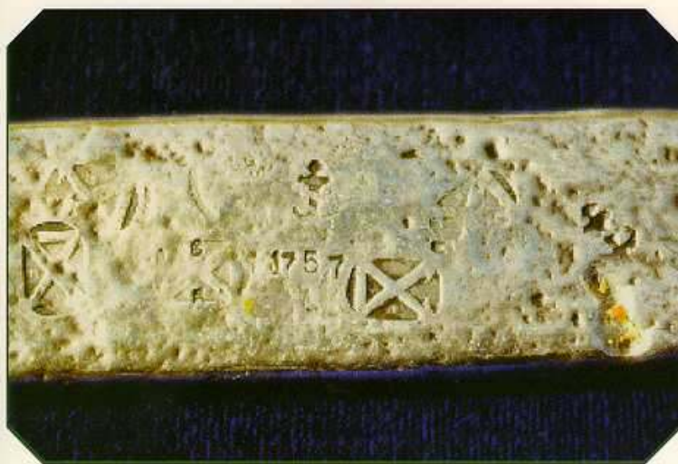
This silver bar, with the date 1757 clearly visible, was recovered at a site identified by the psychic.