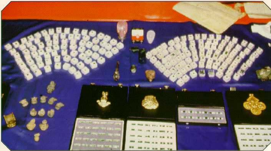
Sue and Victor Benilous display their mega-million dollar treasures.